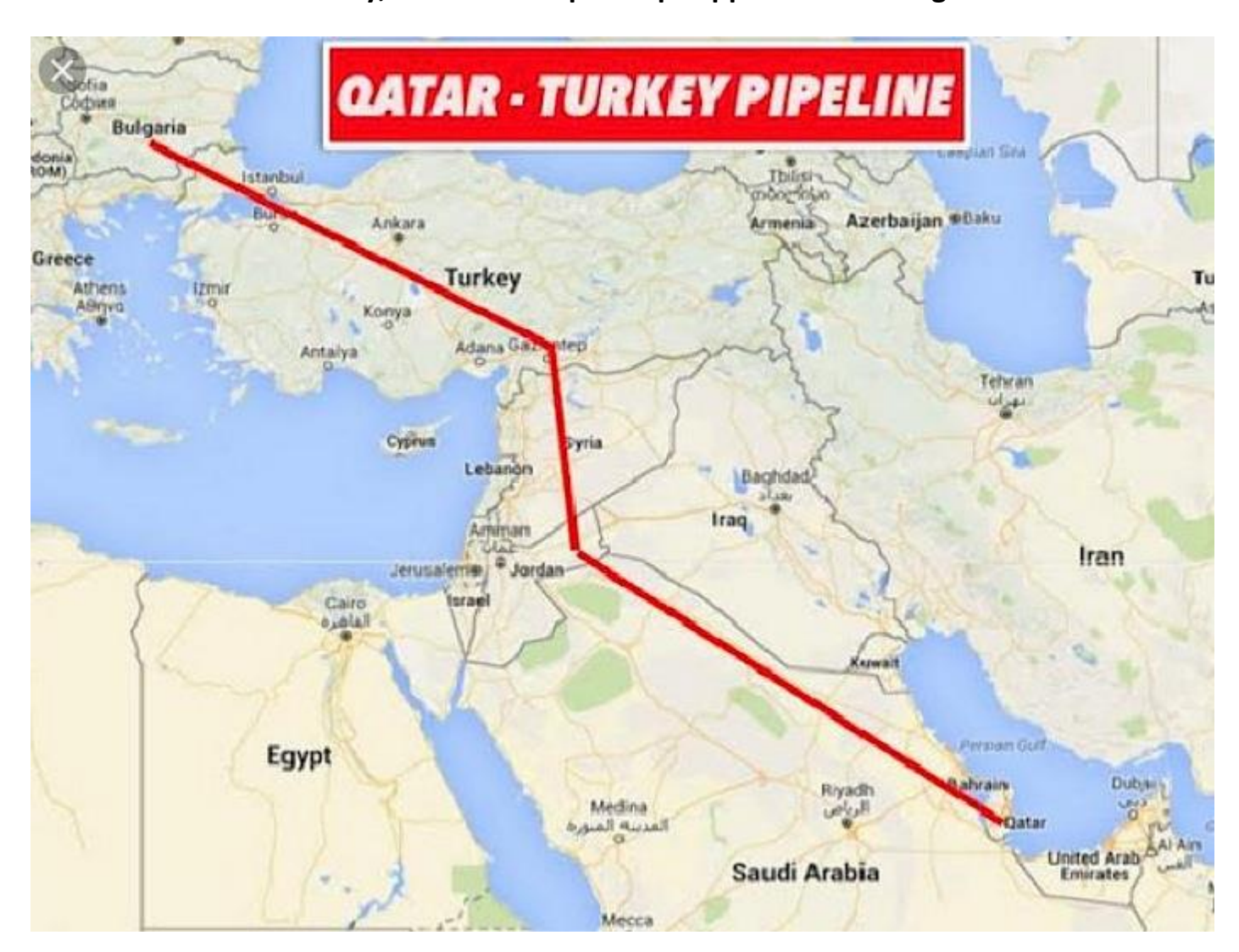
The Qatar-Turkey pipeline's project

That was a proposal to build a natural gas pipeline from the Iranian—Qatari South Pars/North Dome Gas-Condensate field towards Turkey, where it could connect with the Nabucco pipeline to supply European customers as well as Turkey. One route to Turkey was via Saudi Arabia, Jordan, and Syria, and another was through Saudi Arabia, Kuwait and Iraq. Syria's rationale for rejecting the Qatar proposal was said to be "to protect the interests of its Russian ally, which is Europe's top supplier of natural gas".