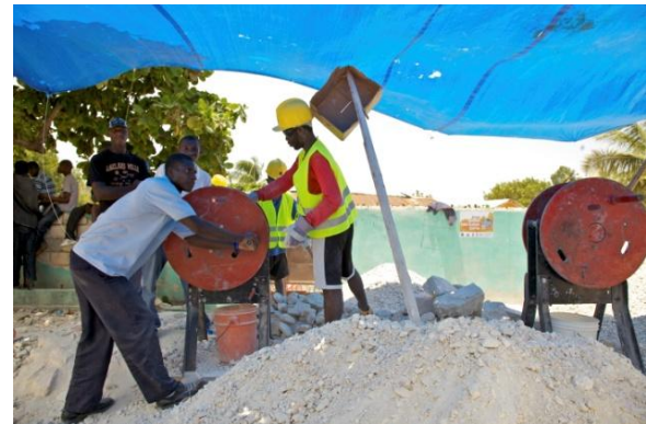
UNDP Public Information Office Trained workers crushing debris at recycling site (Rue Becassine, Port-au-Prince)

The HRF is the largest single source of support for debris management activities in Haiti, providing 92% of the financing for IHRC-approved activities in this sector through US$46 million for three activities. These projects are being implemented in partnership with Government of Haiti ministries, local governments and NGOs.