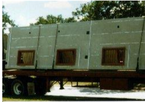
Temporary Jail Cells