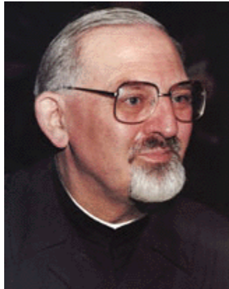
The "Black" Pope Count Hans Kolvenbach—The Jesuit's General